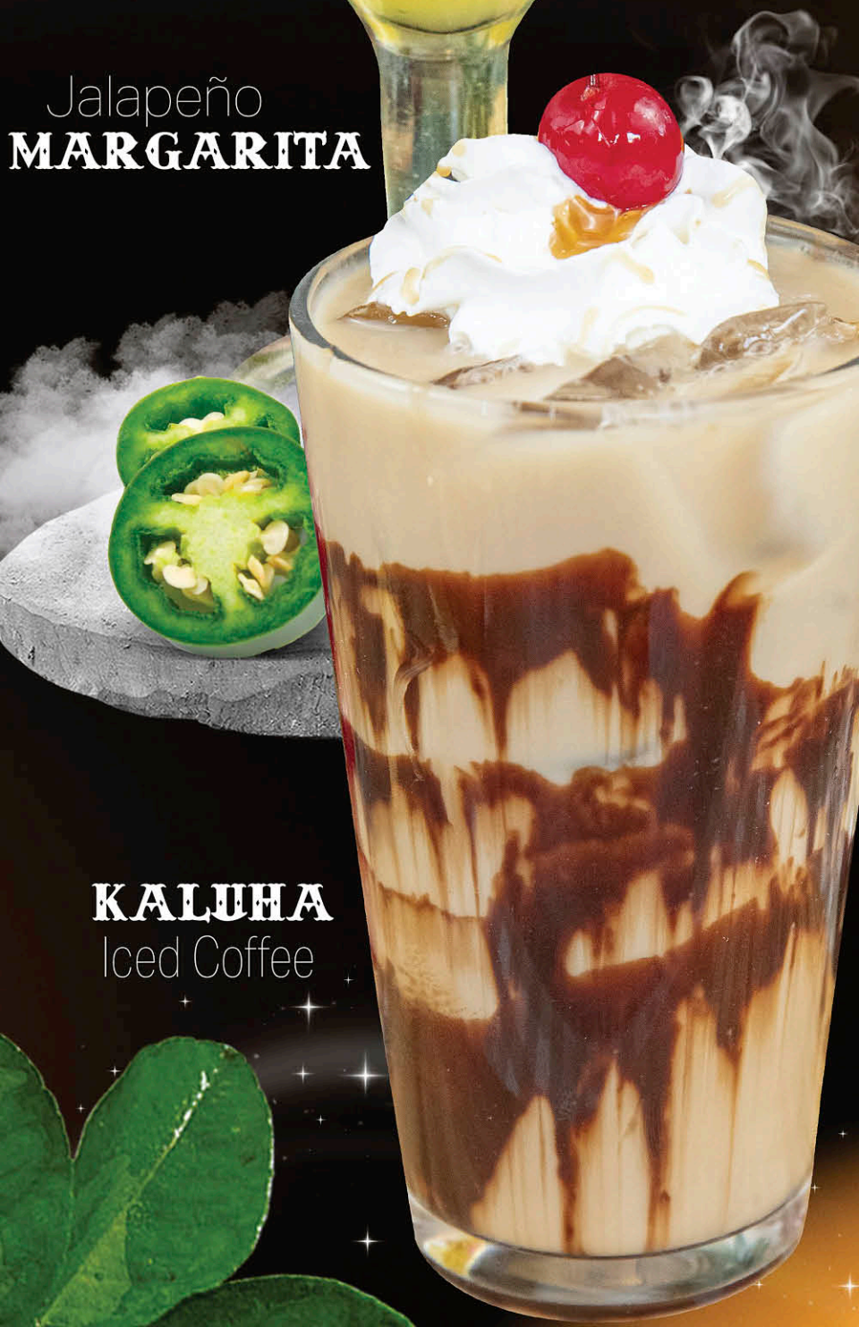
KALUHA Iced Coffee